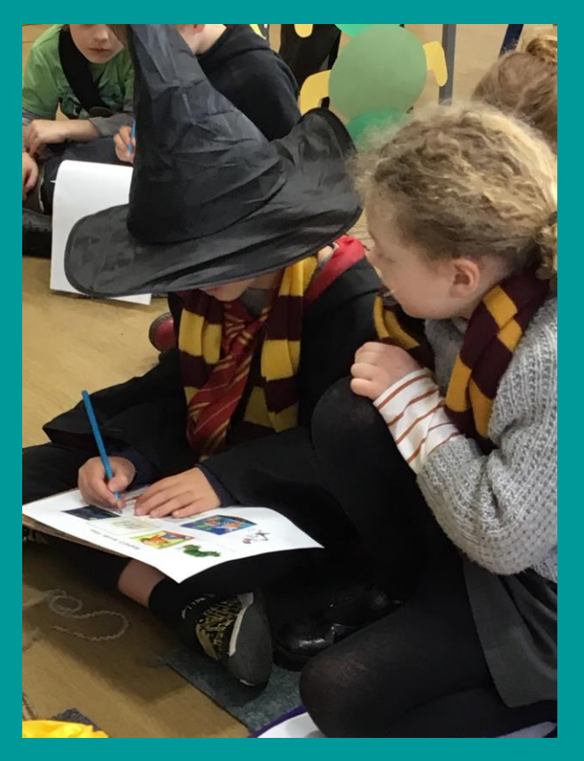
1 - Book Quiz