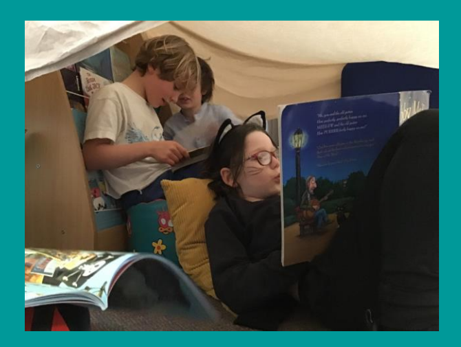
5 - Reading in the reading den