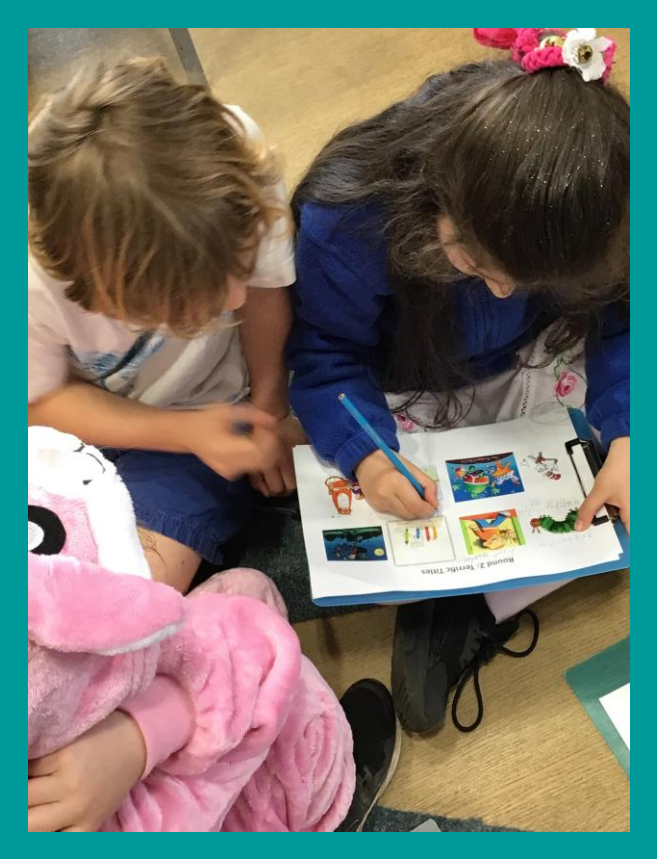
2 - Name the book -quiz